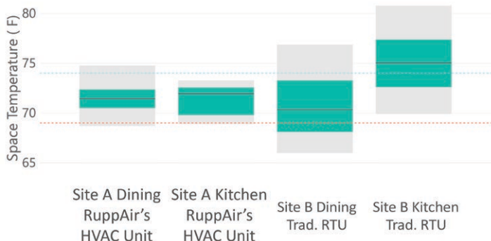
Space Temperature Ranges When Occupied